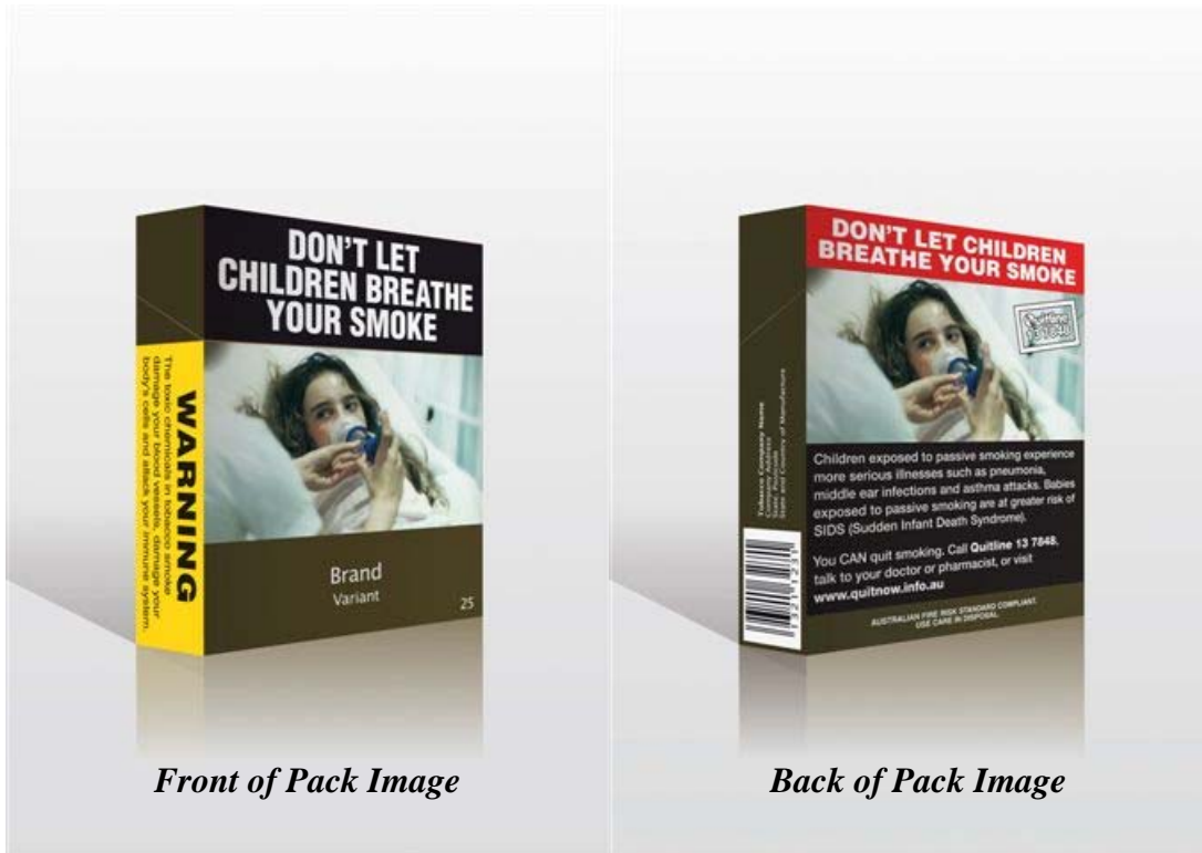
Front of Pack Image