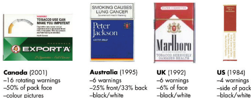
Figure 1 Cigarette package warning labels of the four countries (Canada, Australia, United Kingdom, United States) participating in the International Tobacco Four Country Survey (as of 2002).

first warning labels in 1972. 28 Cross-sectional surveys conducted in Canada during the 1990s found that the majority of smokers reported that package warning labels are an important source of health information and have increased their awareness of the risks of smoking. 11, 29 In Australia, Borland 30 found that, relative to non-smokers, smokers demonstrated an increase in their knowledge of the main constituents of tobacco smoke and identified significantly more disease groups following the introduction of new Australian warning labels in 1995. However, considering the importance of health warnings among tobacco control policies, there is a need for additional research. In particular, there is a need for research that can help policymakers to choose the size and general strength of health warnings from within the general recommendations outlined in the FTC.